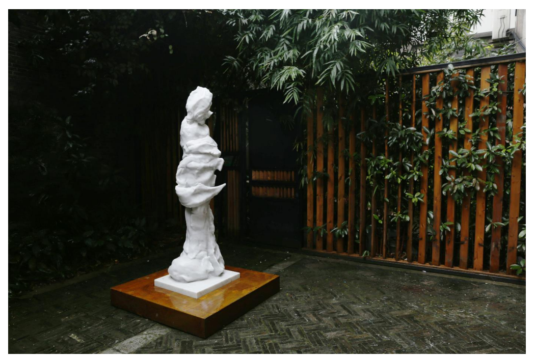
Chen Yujun, Voyager and King, 2018, White Carrara marble, 181 x 55 x 51 cm