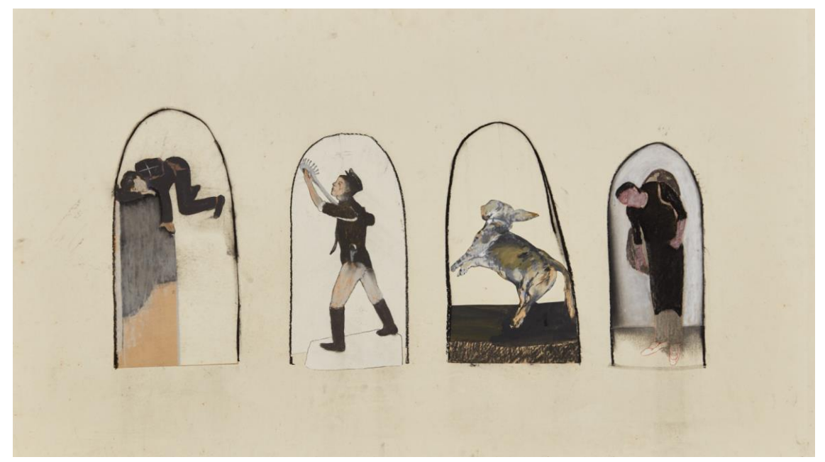
Chen Yujun, Each Single Self NO.8klqw755, 2007, Hand-made paper, toner and marker pen, 66 x 115 cm