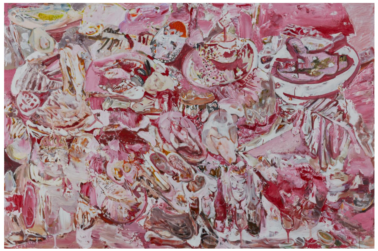
Chen Yujun, Wedding Banquet NO.4, 2018, Acrylic on canvas, 200 x 300 cm