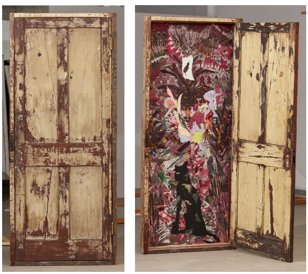
Chen Yujun, Asia Map No. 190611, 2019, Collage on paper, old door, 213 x 91 x 12 cm