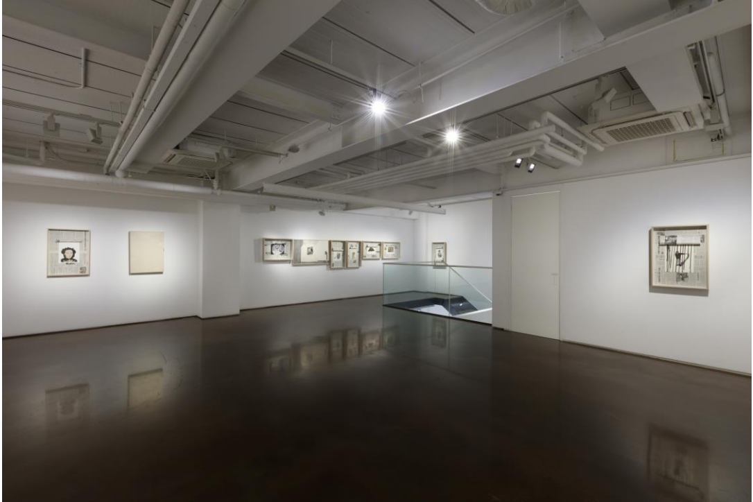
Installation view of Each Single Self, ARARIO GALLERY, Seoul, Korea, 2020