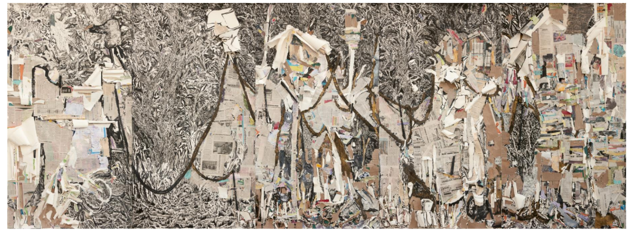
Chen Yujun, Space of 11 Square Meters, hand-made paper, newspaper, acrylic and water ink, 200 x 550 cm